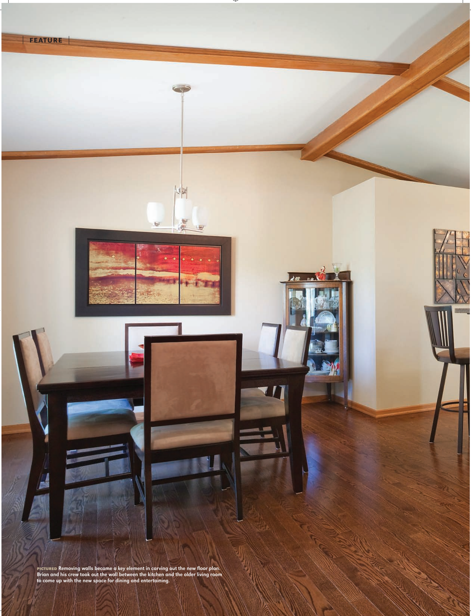
PICTURED Removing walls became a key element in carving out the new floor plan. Brian and his crew took out the wall between the kitchen and the older living room to come up with the new space for dining and entertaining.